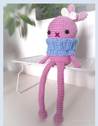
And now you're done!